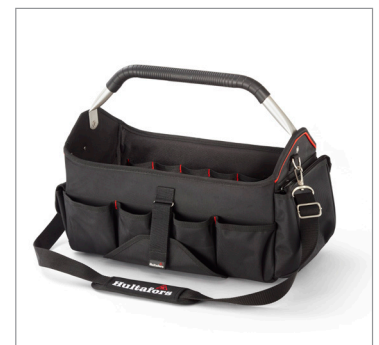
Tool Carrier with 35 pockets.