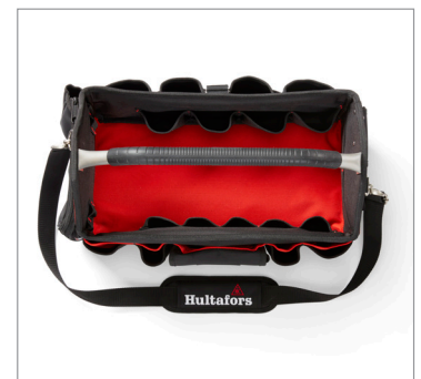
Alternating red and black fabric.